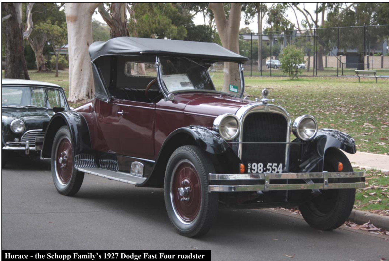
Horace - the Schopp Family's 1927 Dodge Fast Four roadster