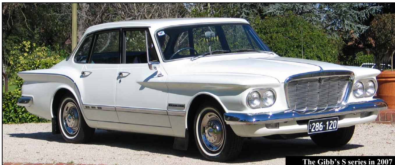
The Gibb's S series in 2007