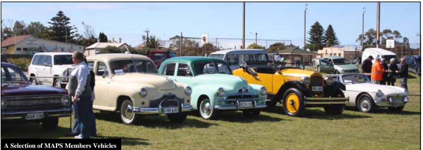
A Selection of MAPS Members Vehicles