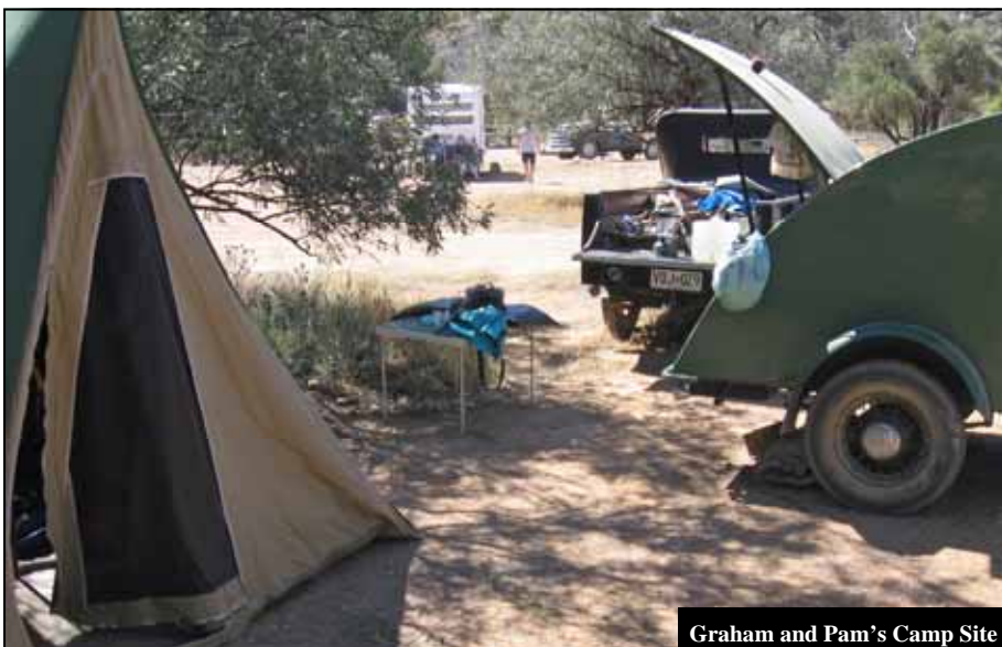
Graham and Pam's Camp Site