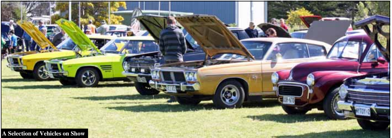
A Selection of Vehicles on Show