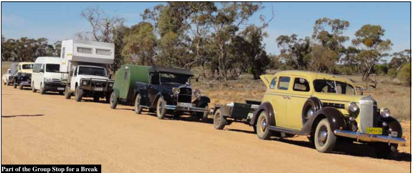
Part of the Group Stop for a Break