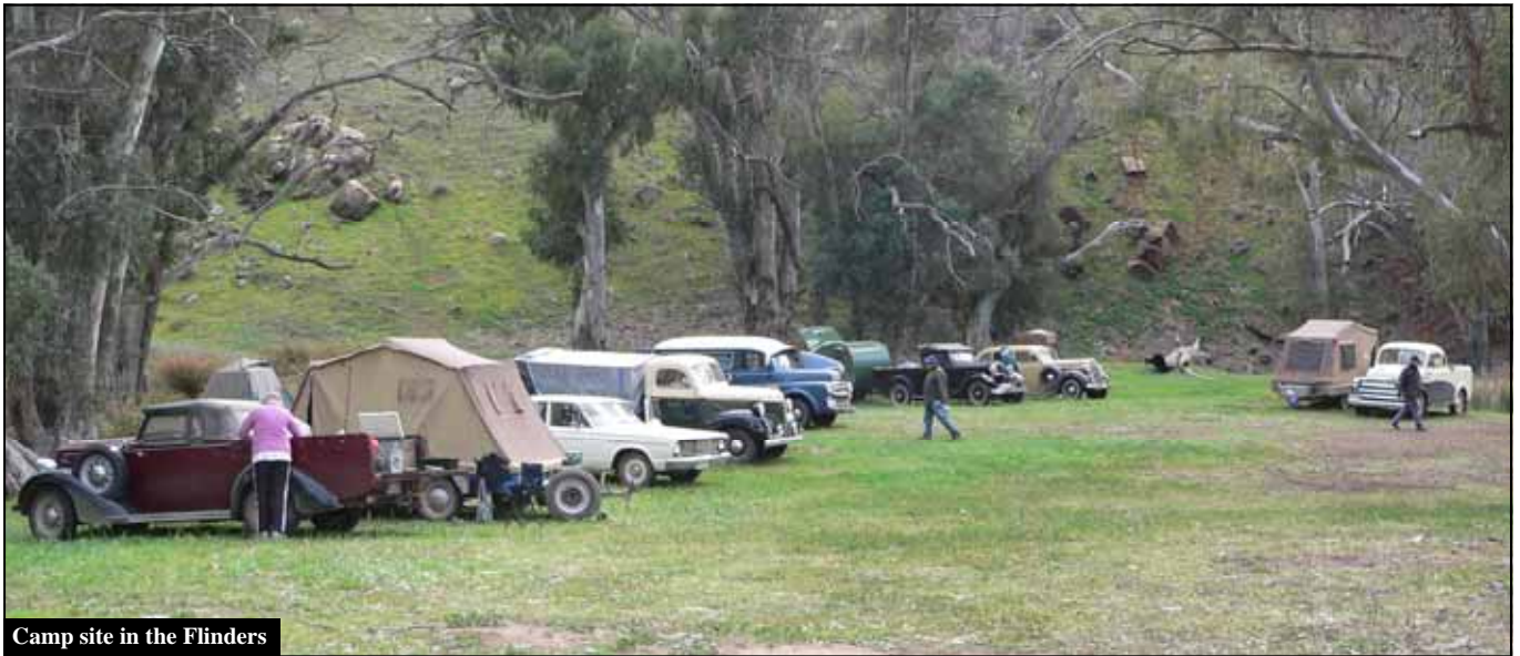
Camp site in the Flinders

managed to eat it all with a Wagon wheel and Monte Carlo for dessert.