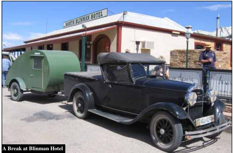
A Break at Blinman Hotel