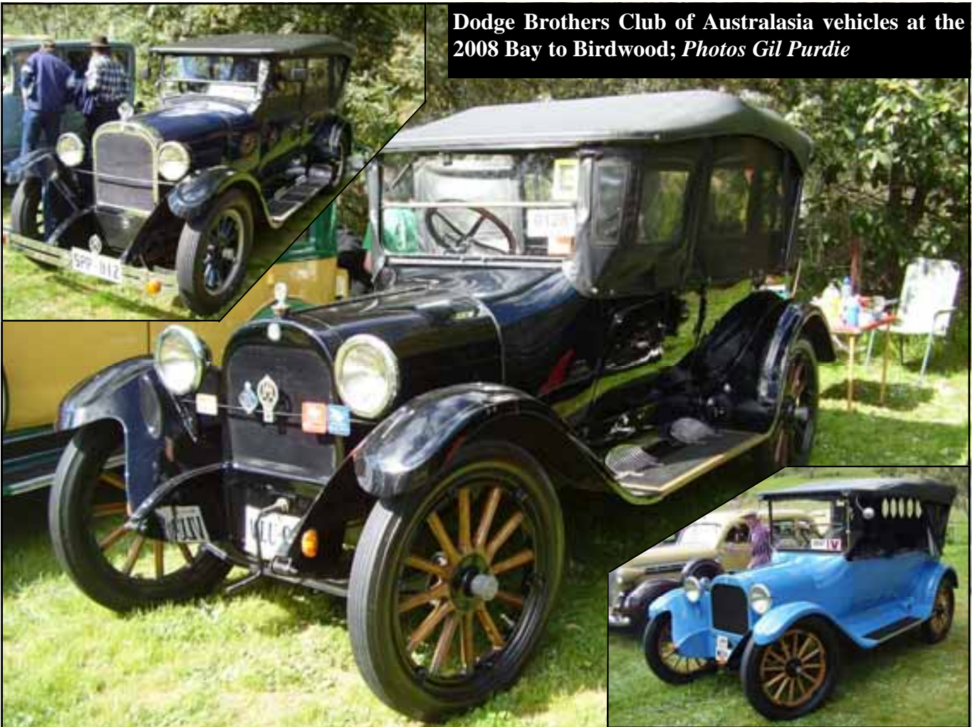
Dodge Brothers Club of Australasia vehicles at the 2008 Bay to Birdwood