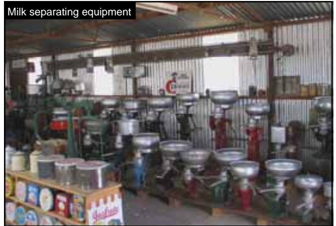
Milk separating equipment