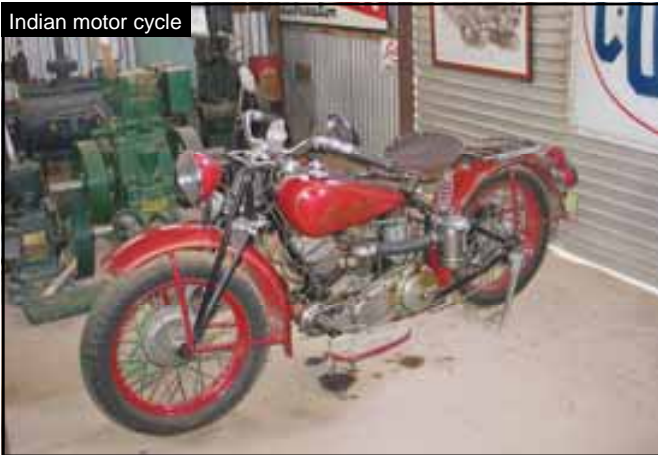
Indian motor cycle