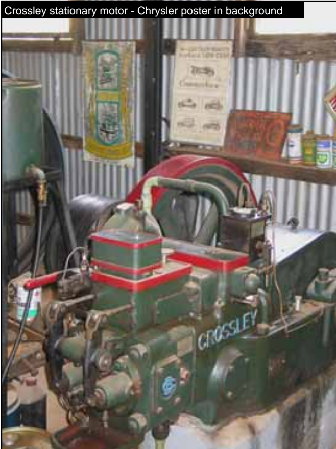
Crossley stationary motor - Chrysler poster in background