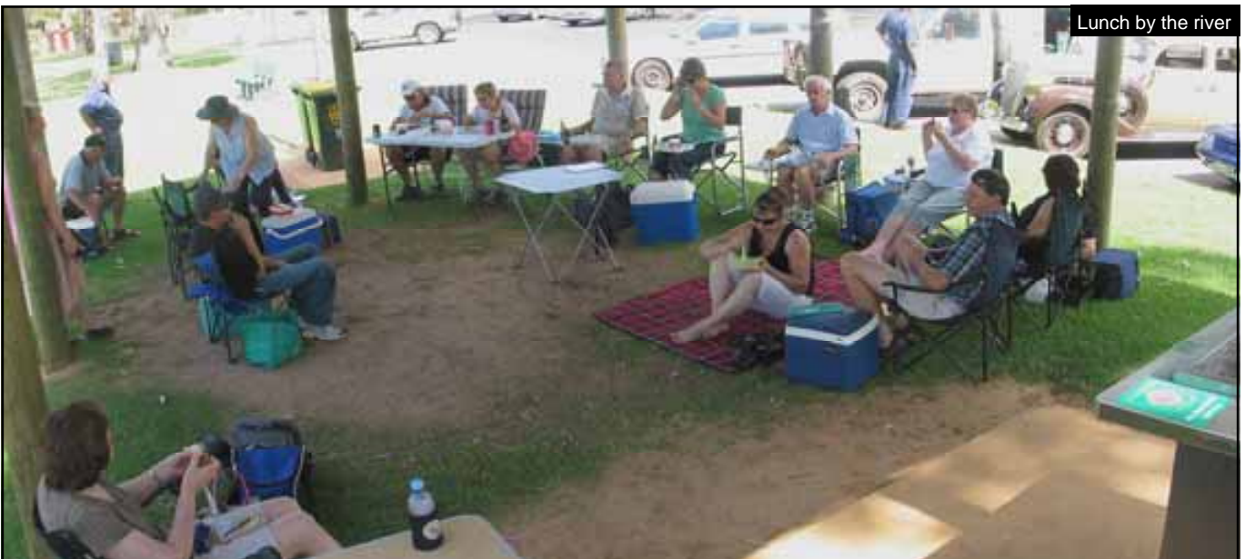
Lunch by the river