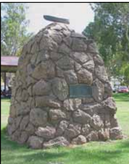
Capt Charles Sturt passed this spot in 1830