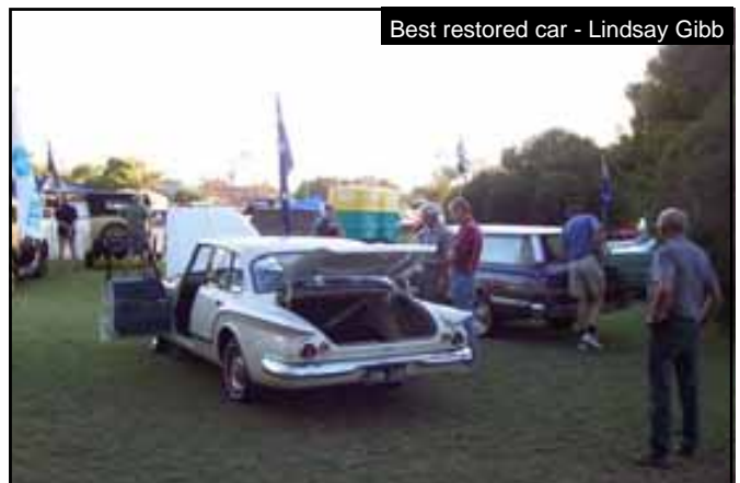
Best restored car - Lindsay Gibb