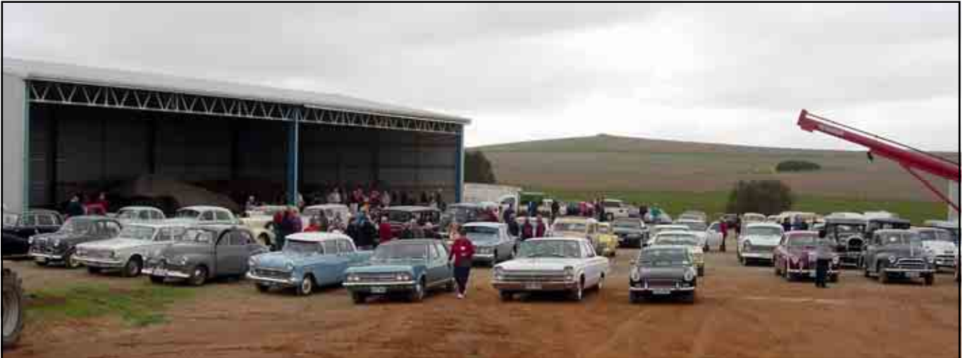
Miscellaneous Meanderers.