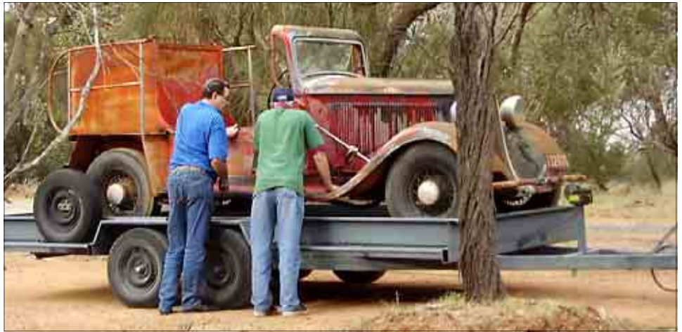
Photo at bottom shows the restoration starting on the day before the Bay to Birdwood - the so called "Rest Day" for the Victory 6 Rally. Pictured are Denis and Fraser Thompson - and Dick Hart's legs.

Photos on right show the vehicle being collected at Seppeltsfield with the assistance of Malcolm Bean.