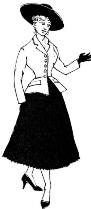
1948 Dior outfit