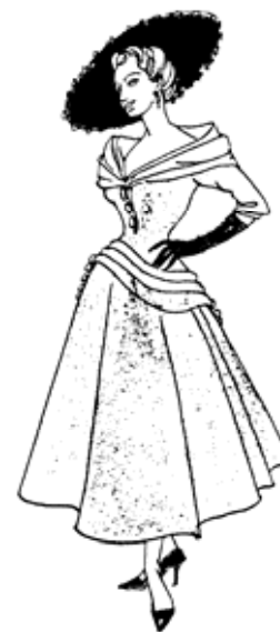
1948 Dior dress

Club events co-ordinator has contact details and / or entry forms for other club's events.