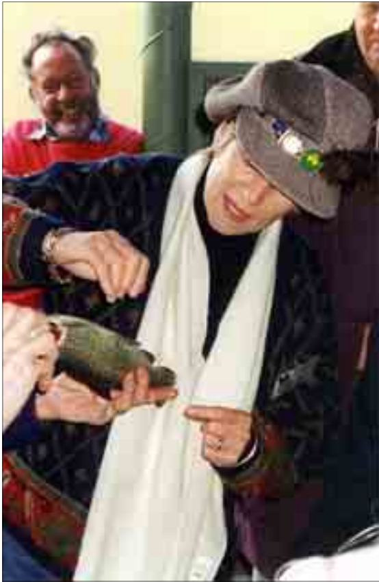
Left: I think the patient died on the operating table.